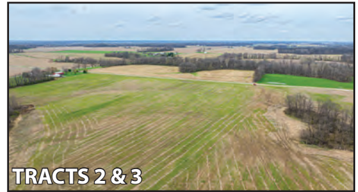
TRACTS 2 & 3