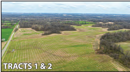
TRACTS 1 & 2