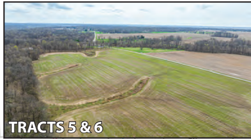
TRACTS 5 & 6