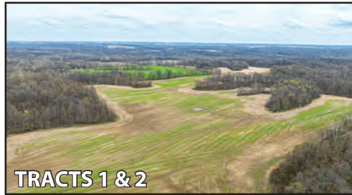
TRACTS 1 & 2