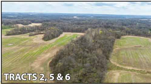
TRACTS 2, 5 & 6