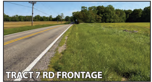
TRACT 7 RD FRONTAGE