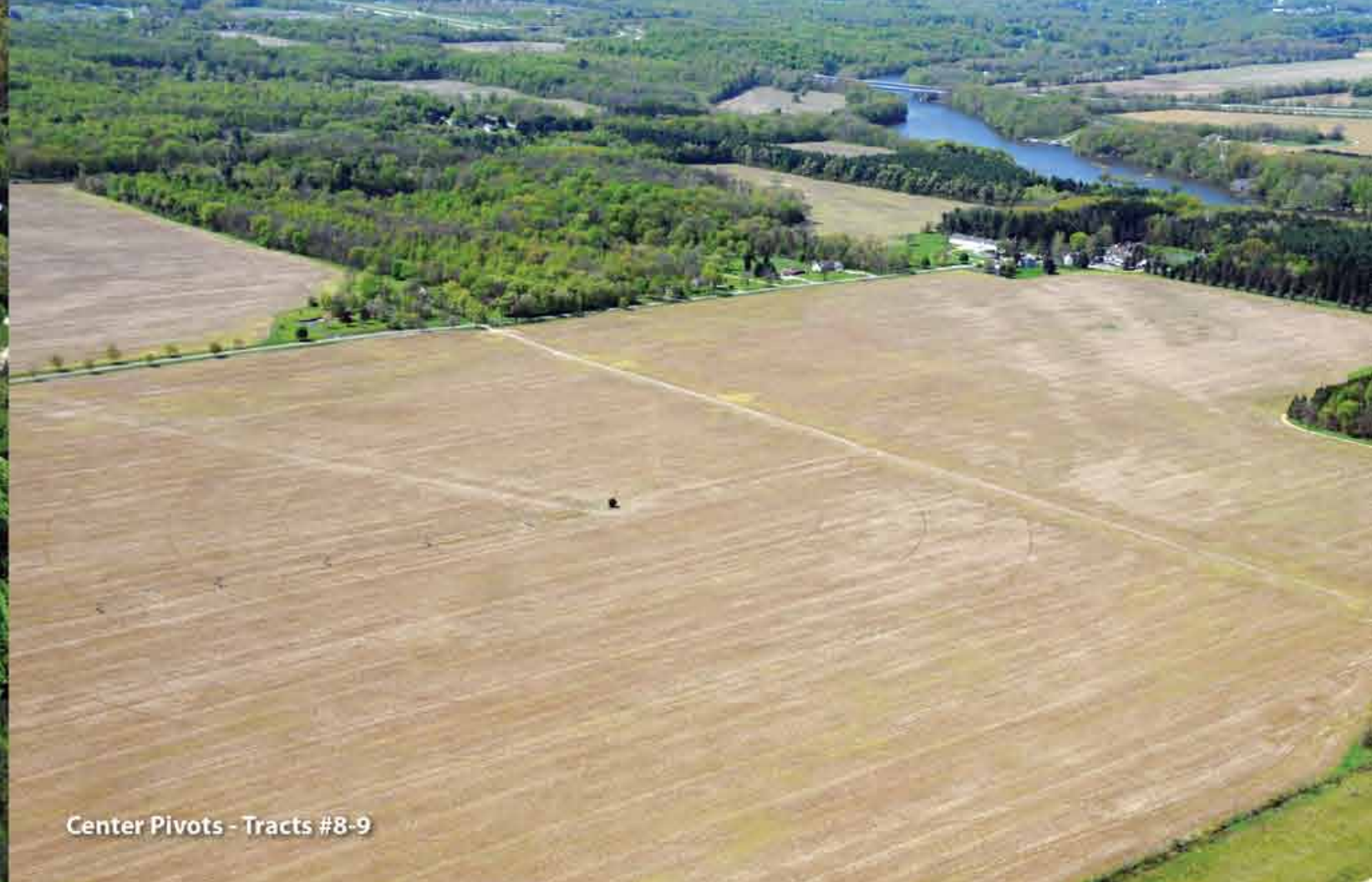
Center Pivots - Tracts #8-9