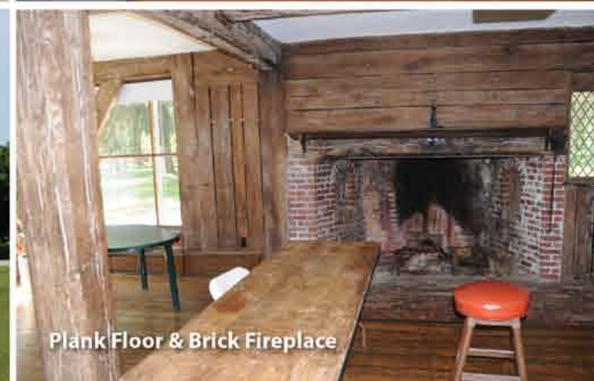
Plank Floor & Brick Fireplace