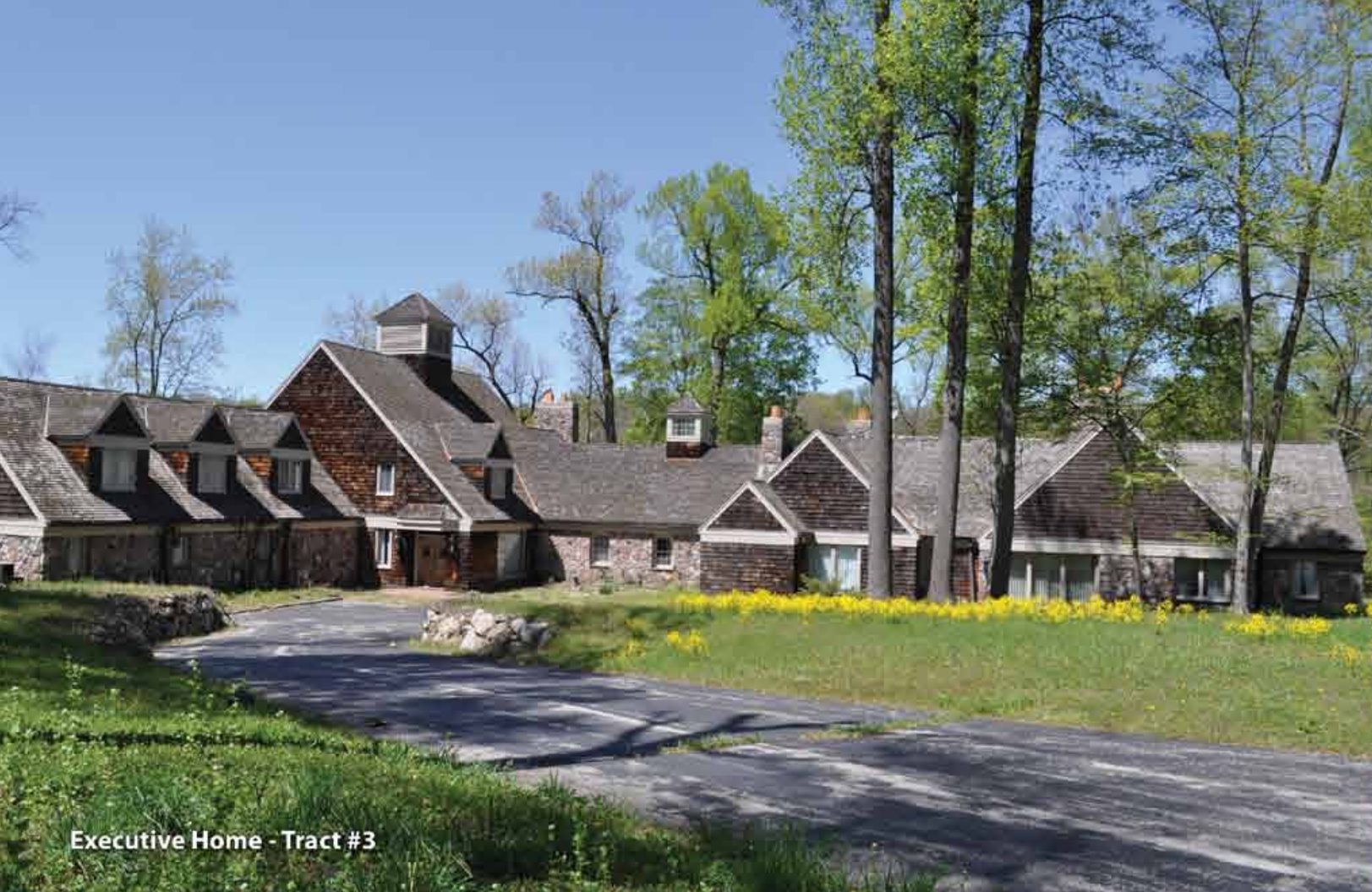
Executive Home - Tract #3