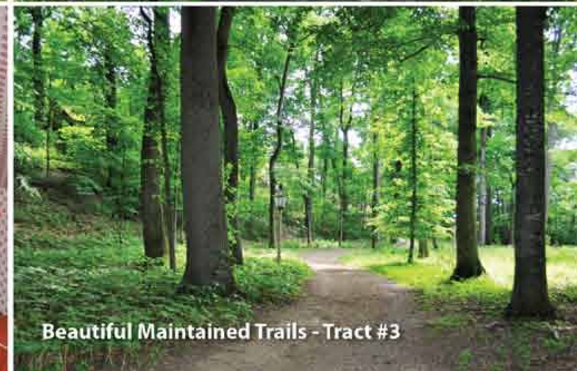
Beautiful Maintained Trails - Tract #3