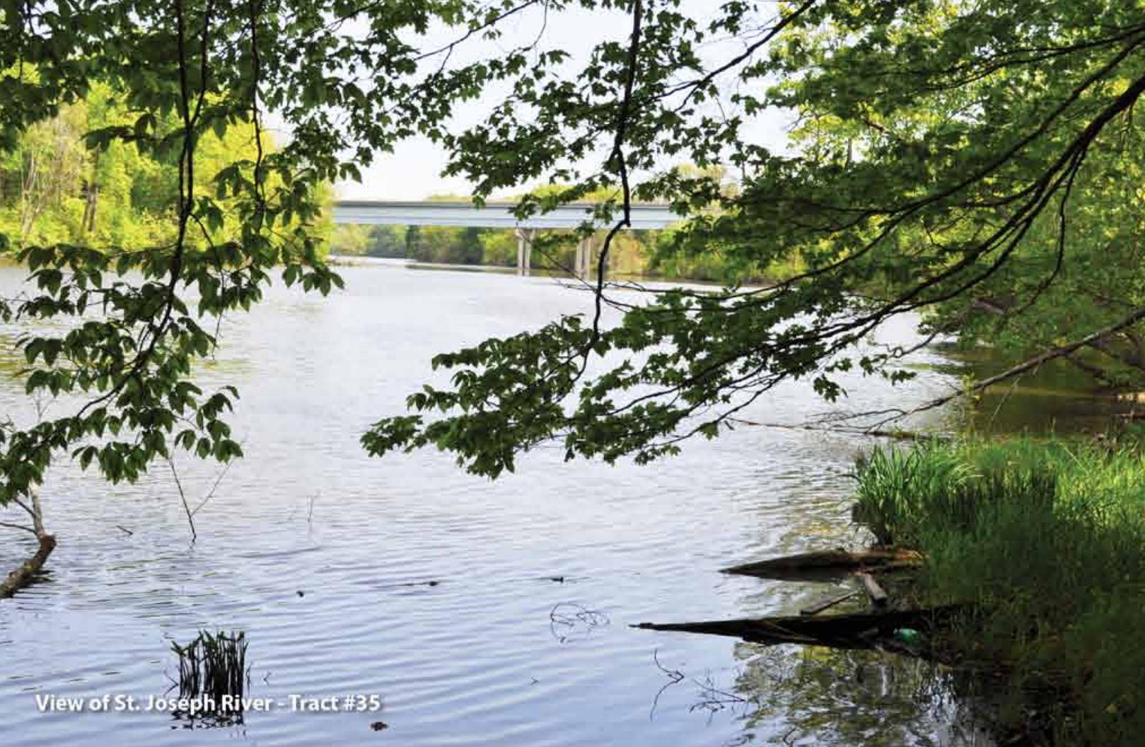
View of St. Joseph River - Tract #35