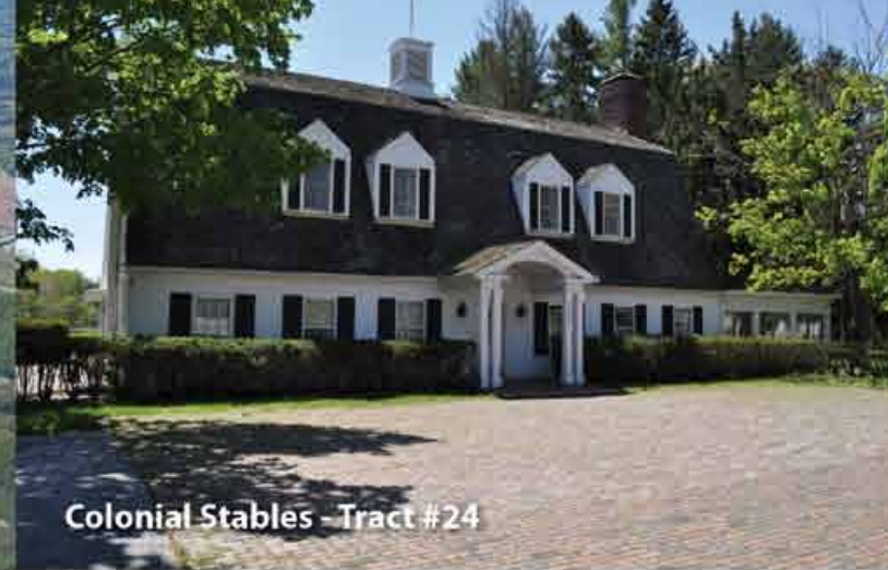
Colonial Stables - Tract #24

Pumphouse 1,500 gal. / min. 150 hp elec. motor