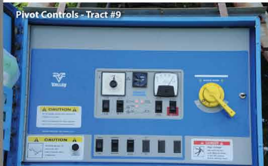
Pivot Controls - Tract #9