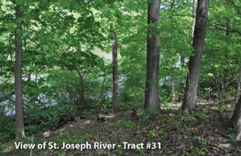
View of St. Joseph River - Tract #31