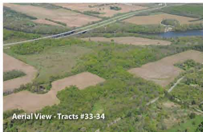
Aerial View - Tracts #33-34