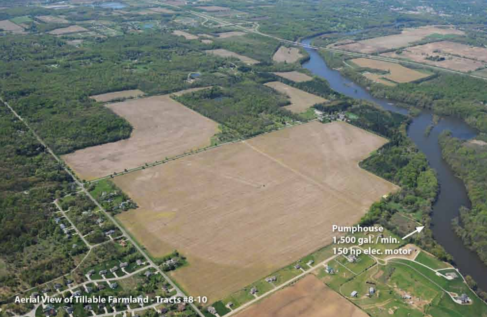
Aerial View of Tillable Farmland - Tracts #8-10

Pumphouse 1,500 gal. / min. 150 hp elec. motor