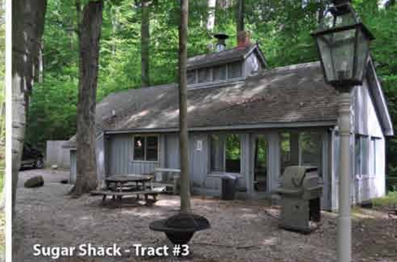
Sugar Shack - Tract #3