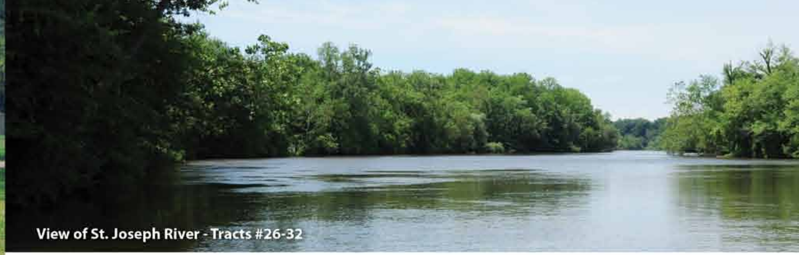
View of St. Joseph River - Tracts #26-32