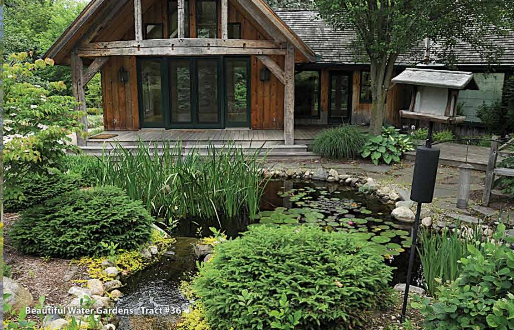
Beautiful Water Gardens - Tract #36