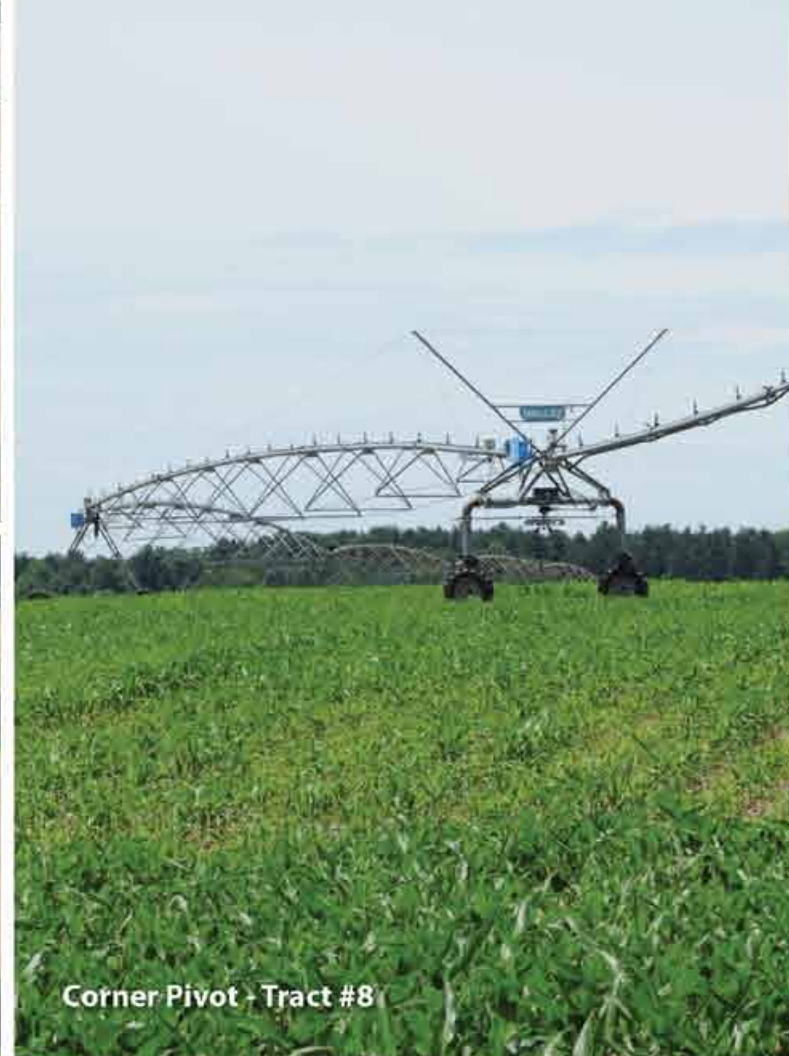
Corner Pivot - Tract #8