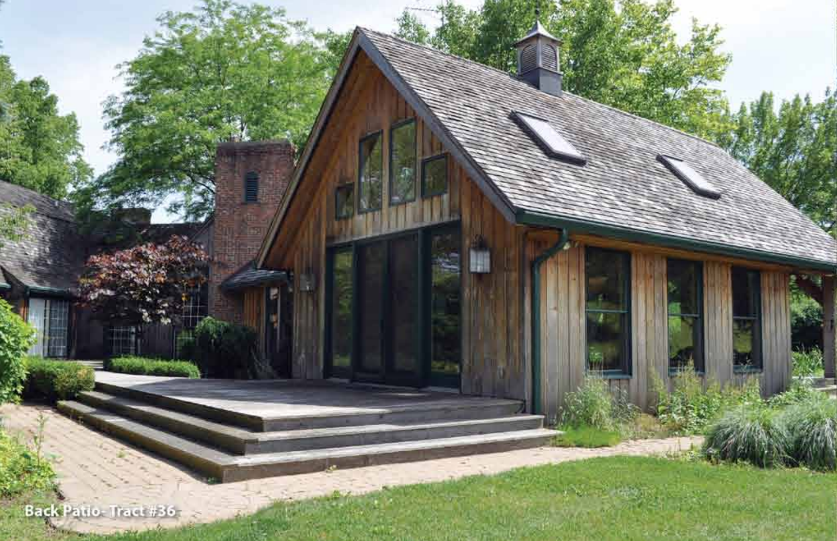
Back Patio- Tract #36