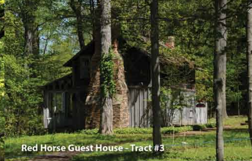
Red Horse Guest House - Tract #3