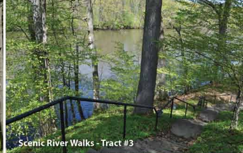
Scenic River Walks - Tract #3