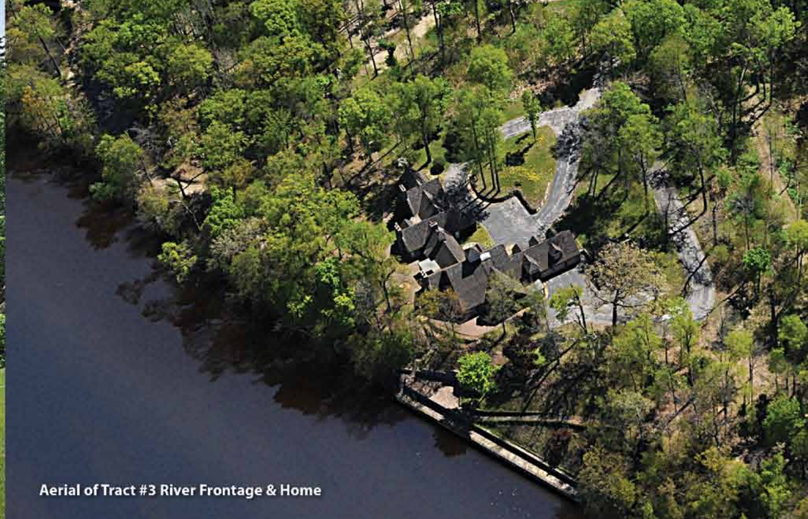
Aerial of Tract #3 River Frontage & Home