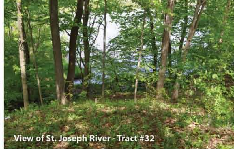
View of St. Joseph River - Tract #32