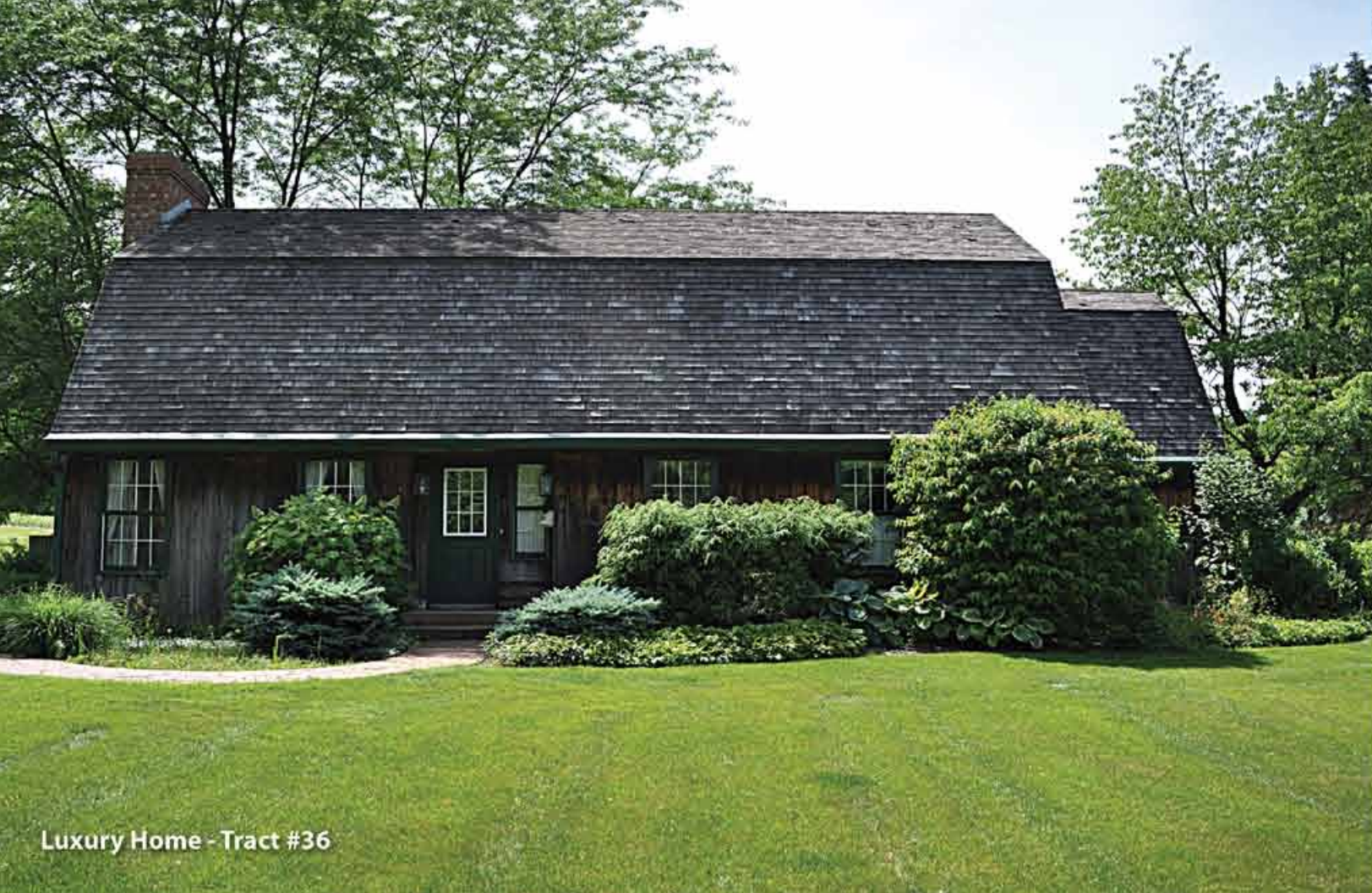
Luxury Home - Tract #36