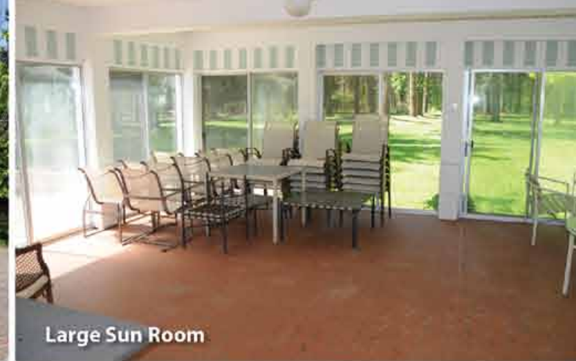
Large Sun Room