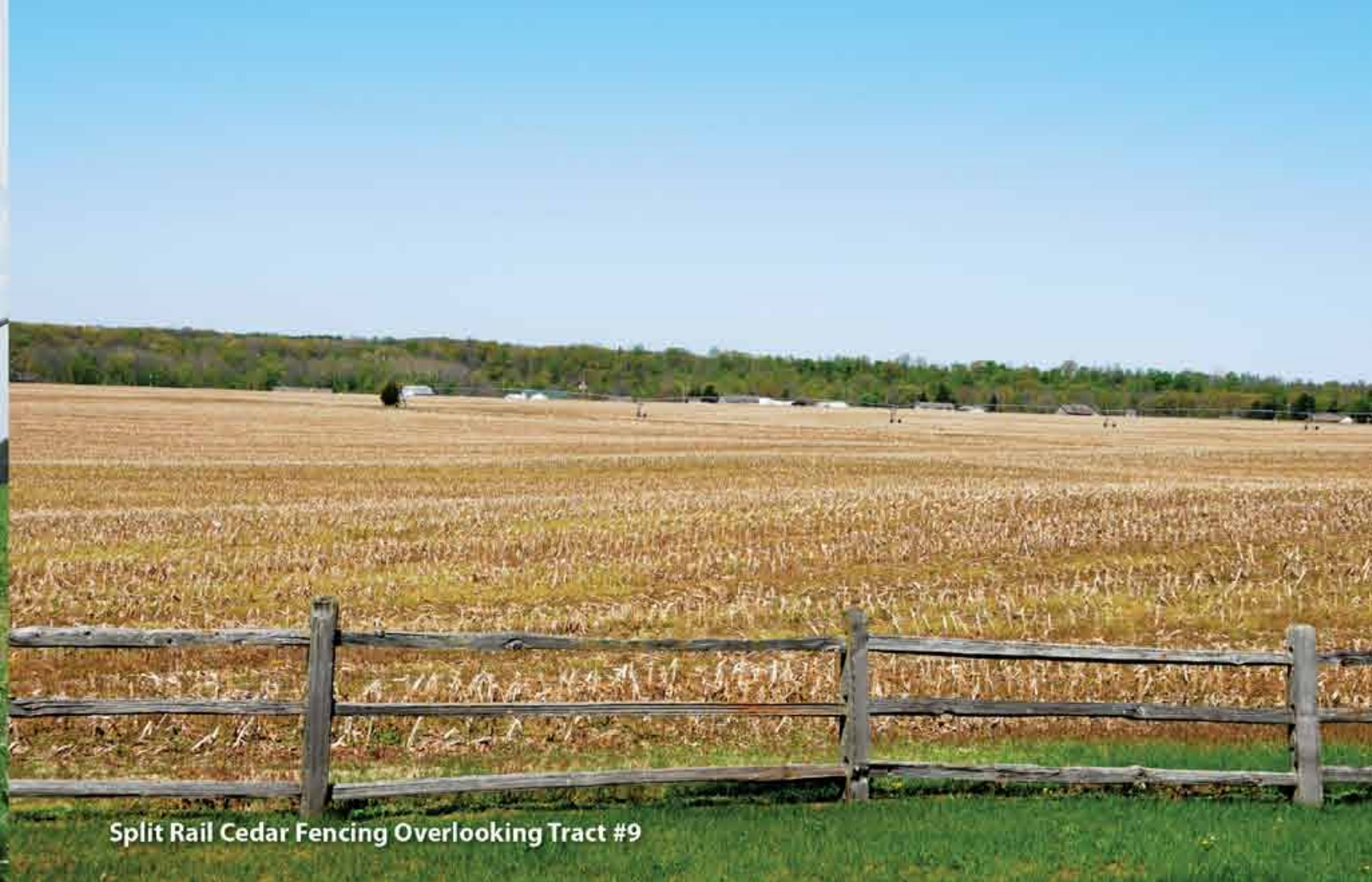
Split Rail Cedar Fencing Overlooking Tract #9