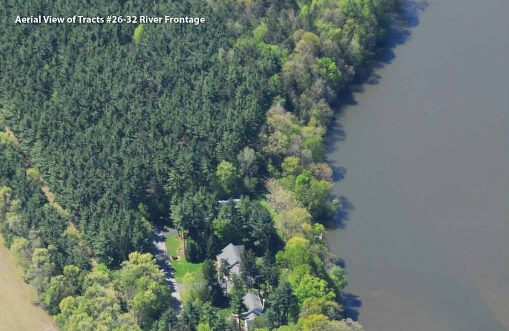
Aerial View of Tracts #26-32 River Frontage