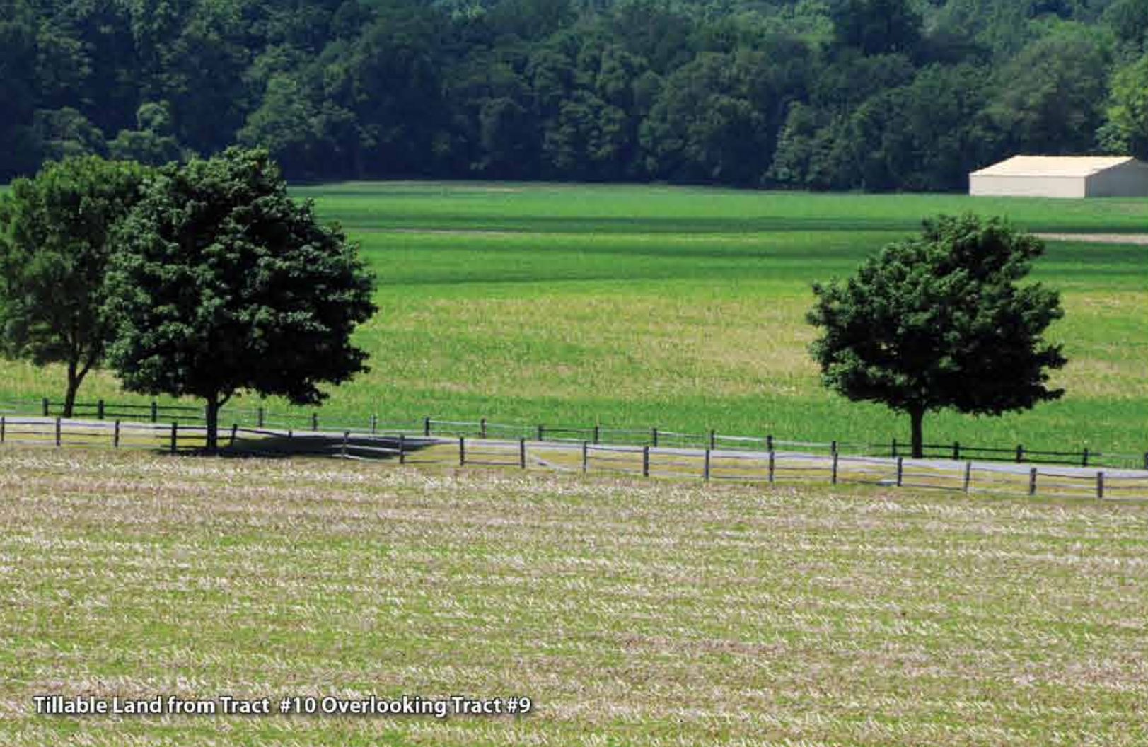
Tillable Land from Tract #10 Overlooking Tract #9