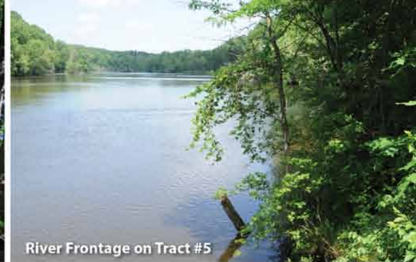
River Frontage on Tract #5