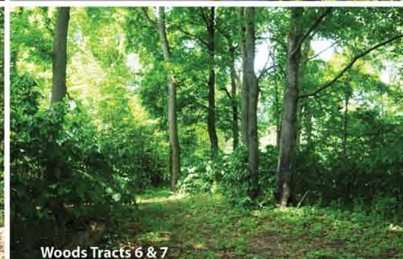
Woods Tracts 6 & 7