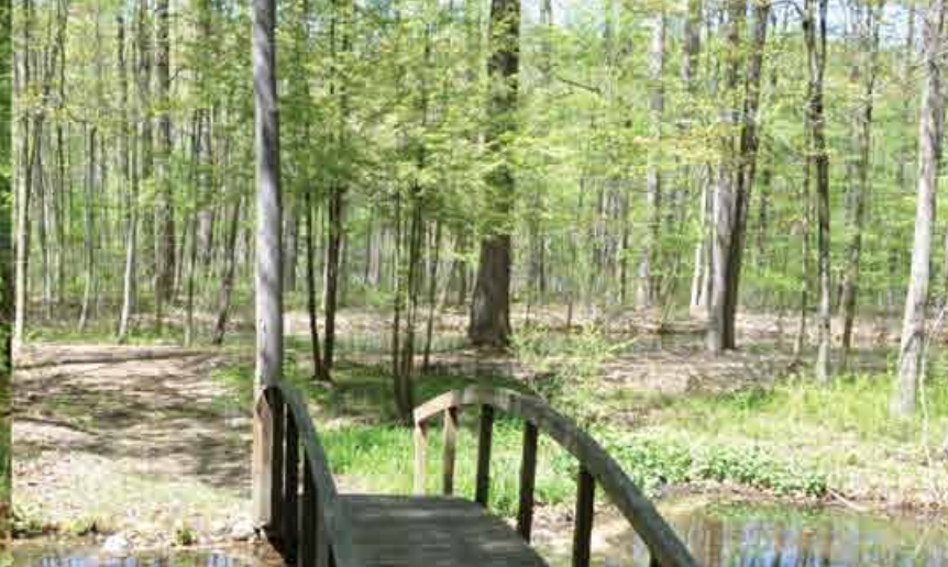
Walking Bridge over Pond - Tract #4