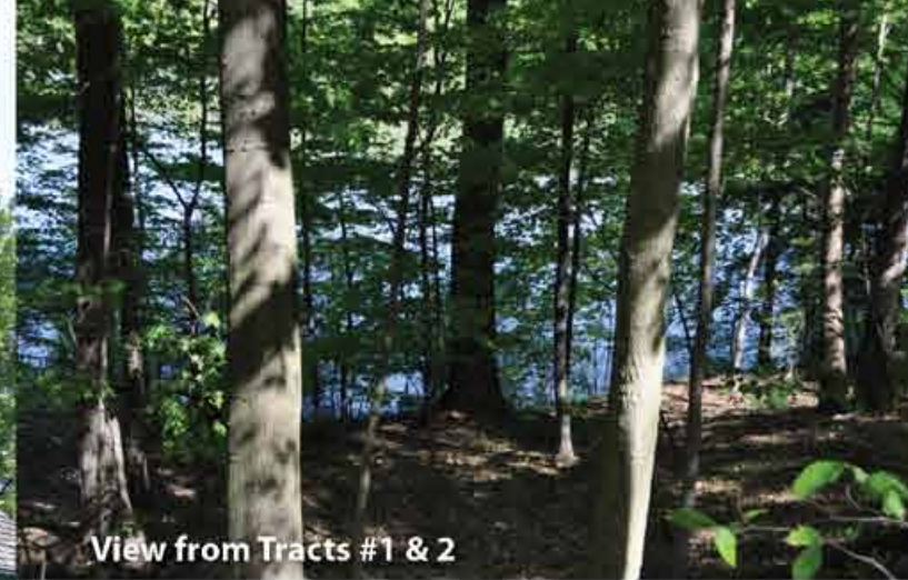
View from Tracts #1 & 2