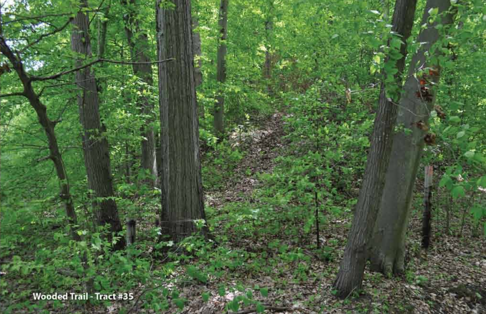
Wooded Trail - Tract #35