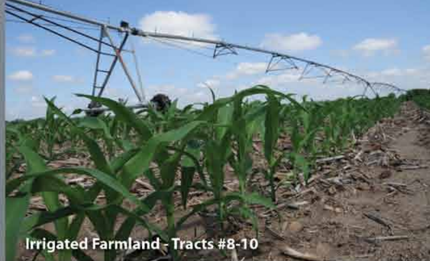
Irrigated Farmland - Tracts #8-10