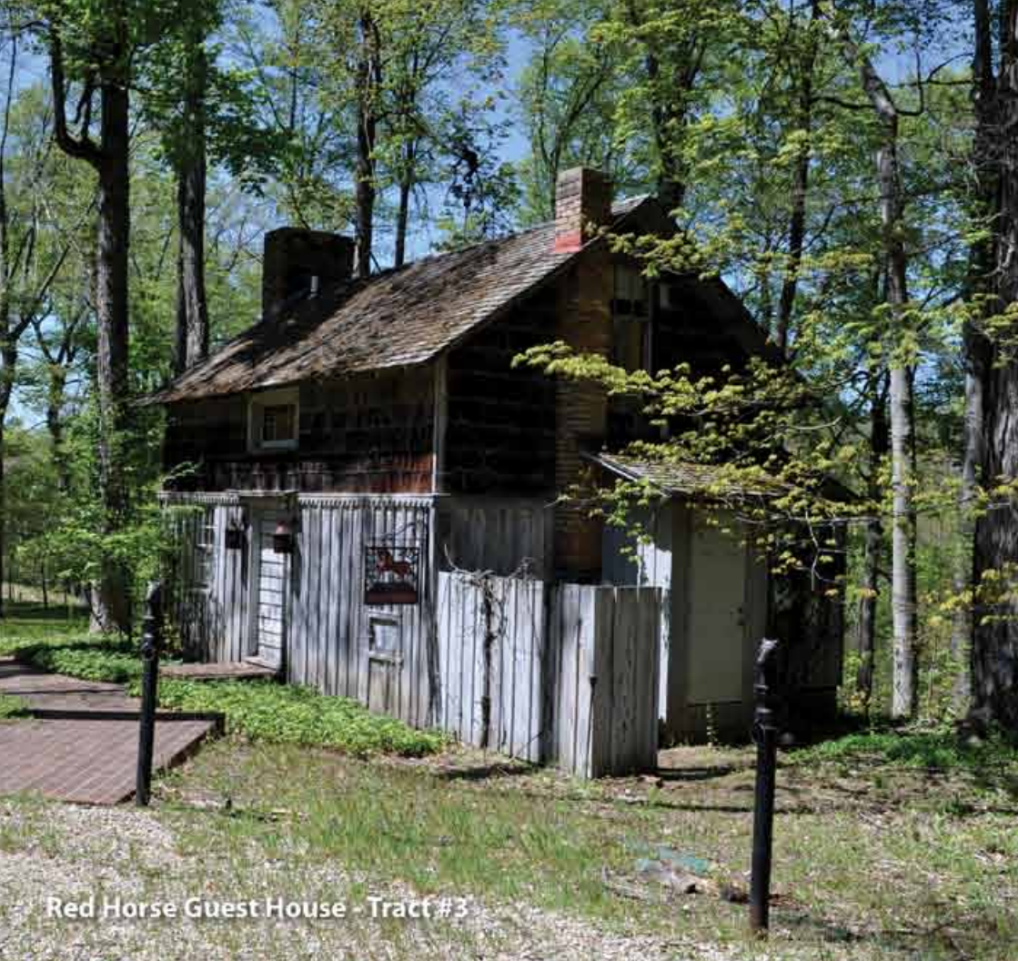
Red Horse Guest House - Tract #3