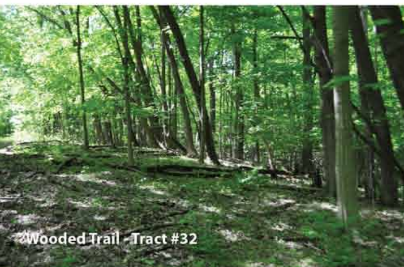
Wooded Trail - Tract #32