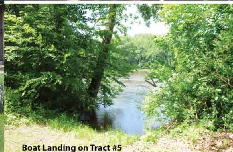
Boat Landing on Tract #5