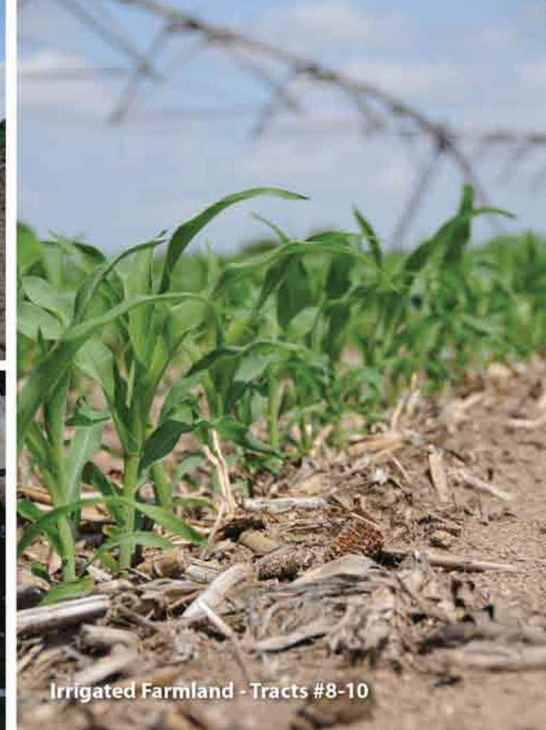
Irrigated Farmland - Tracts #8-10