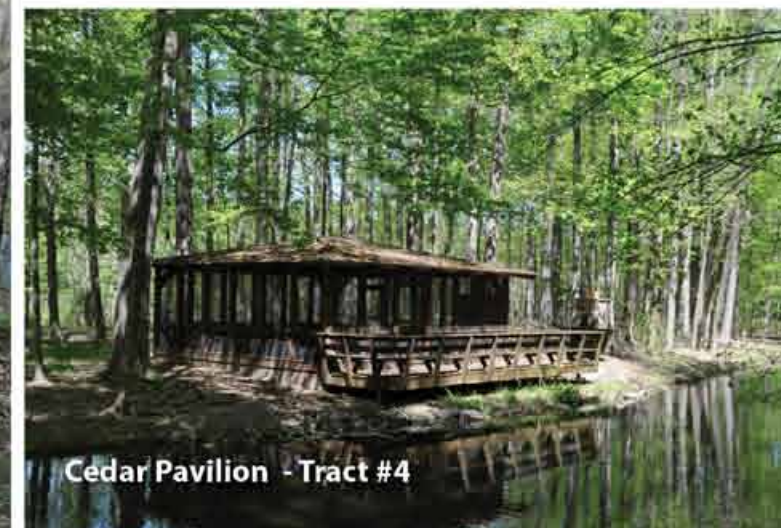
Cedar Pavilion - Tract #4