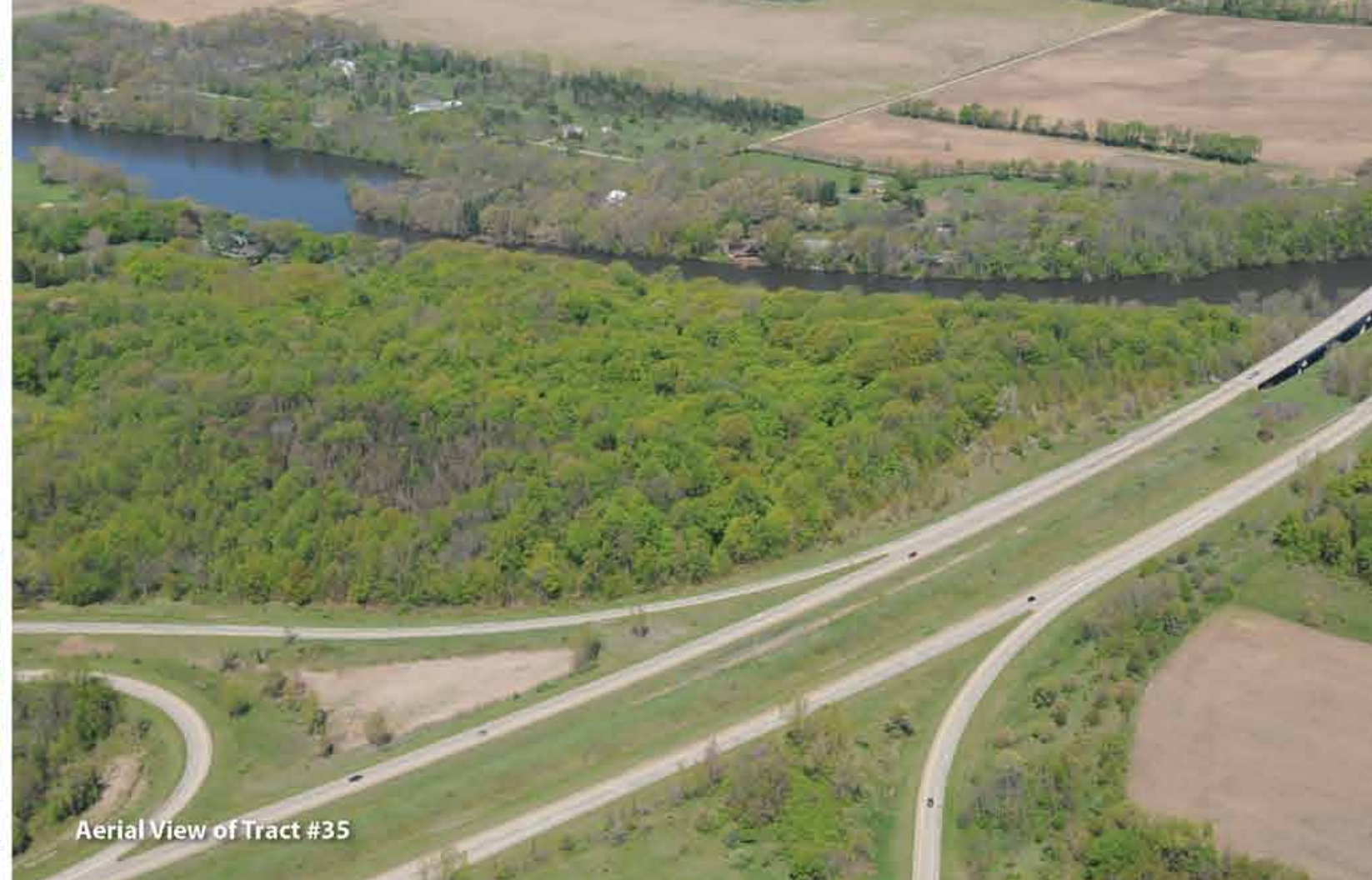
Aerial View of Tract #35