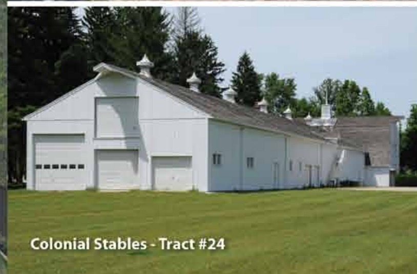
Colonial Stables - Tract #24