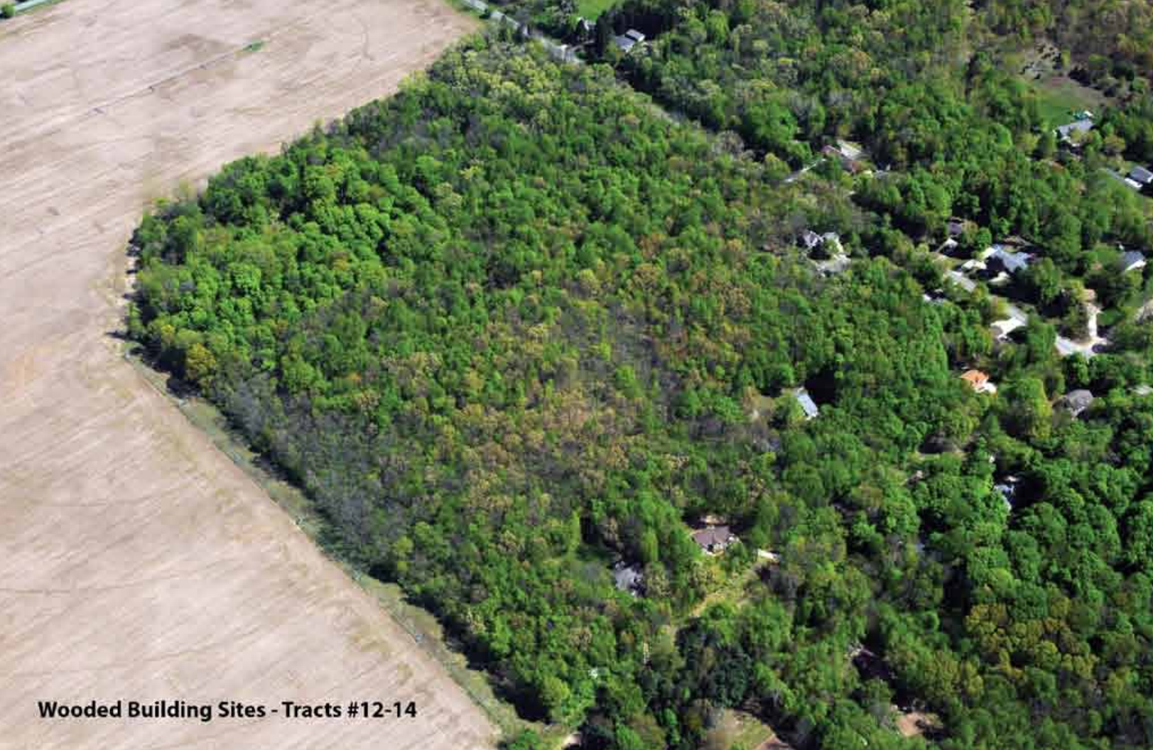
Wooded Building Sites - Tracts #12-14