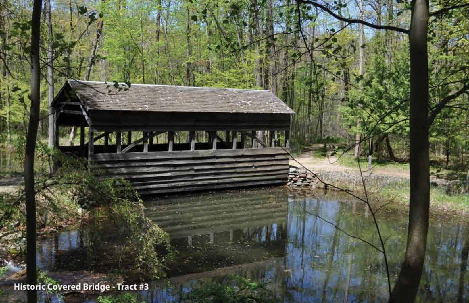
Historic Covered Bridge - Tract #3