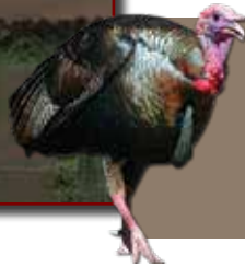
The deer and turkey stock images are merely representational of the abundant wildlife on the property and are not owned by Schrader Real Estate & Auction Co.

PROPERTY DIRECTIONS: Take US 33 two miles west out of Churubusco. Take N 750 E north until you reach S 400 E and continue North for ¾ of a mile and the property is located on the west side of the road.