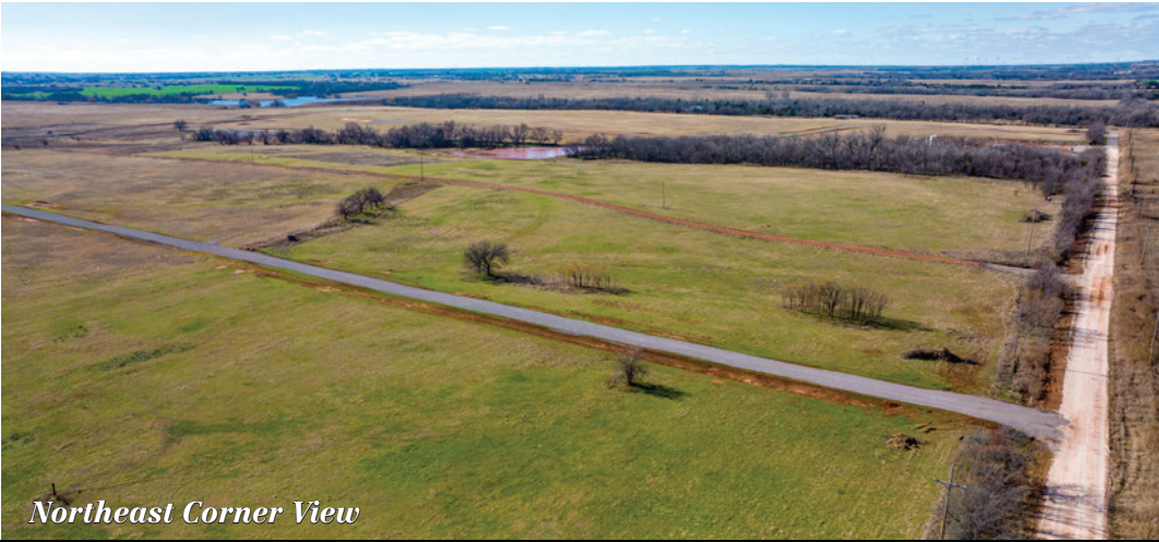
Northeast Corner View