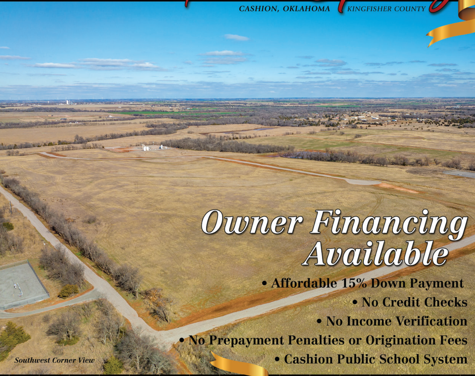
Southwest Corner View