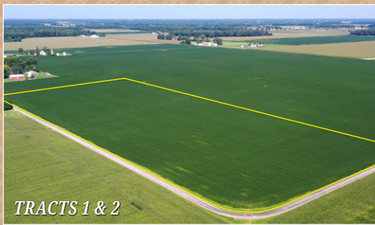
TRACTS 1 & 2