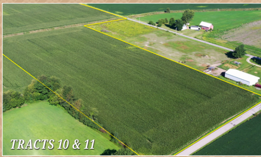
TRACTS 10 & 11