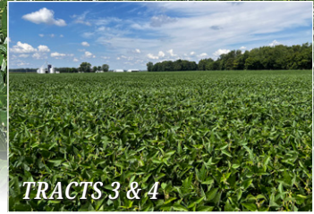
TRACTS 3 & 4