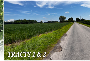
TRACTS 1 & 2