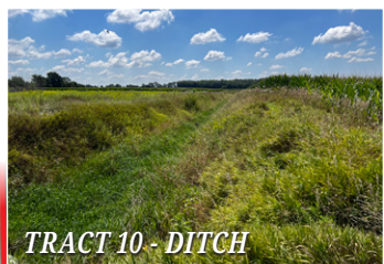
TRACT 10 - DITCH