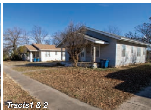
Tracts 1 & 2