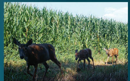
TRAIL CAM PHOTOS OF DEER ON PROPERTY

Whether looking to purchase your first farm, need hunting land that provides income or adding on to your current operation, this 46.27± acre piece of land fits a variety of needs. This farm is located between Highway 81, County U and Muscallounge Rd right in Beetown, WI. The 32± acres of productive work ground provides healthy yields making it great to own or easy to rent. The 14± acres of timber runs along three sides of the property making it “feel bigger than it is” for hunters.