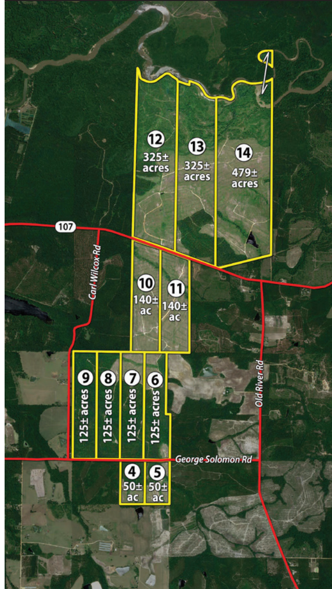
Tracts 4 - 14 comprising Parcels # 0069 012, #0086 001, and #0086 028 in Coffee County, Georgia