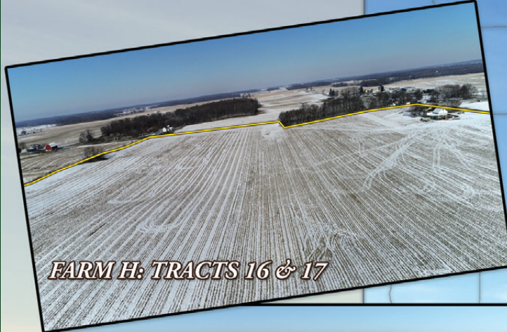
FARM H: TRACTS 16 & 17