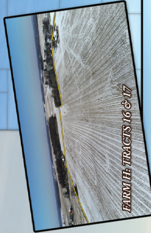
FARM H: TRACTS 16 & 17