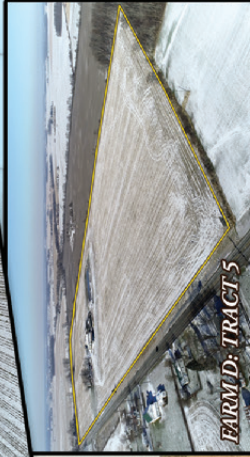
FARM D: TRACT 5