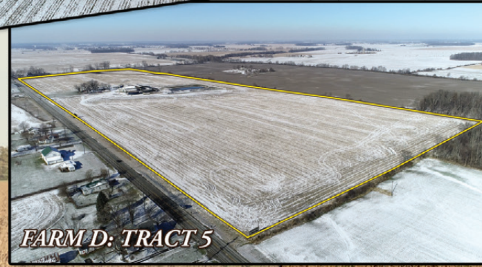
FARM D: TRACT 5