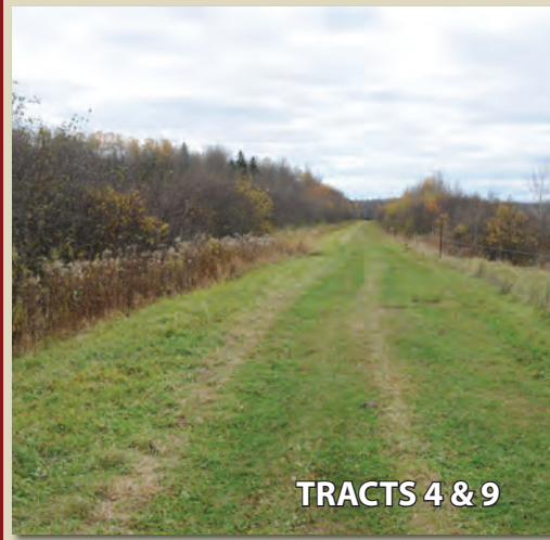
TRACTS 4 & 9