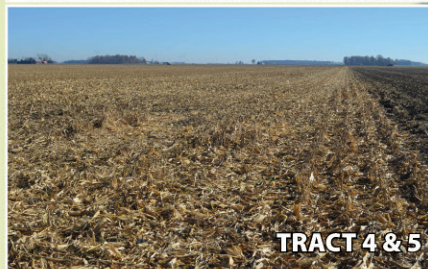
TRACT 4 & 5

PROPERTY LOCATIONS: Tracts 1-3 located in Jackson Township, at northwest corner of Howe and Moore Roads. Tracts 4 & 5 located in Monroe Township, on Morgan Road, 1/2 mile south of Monroeville Road.