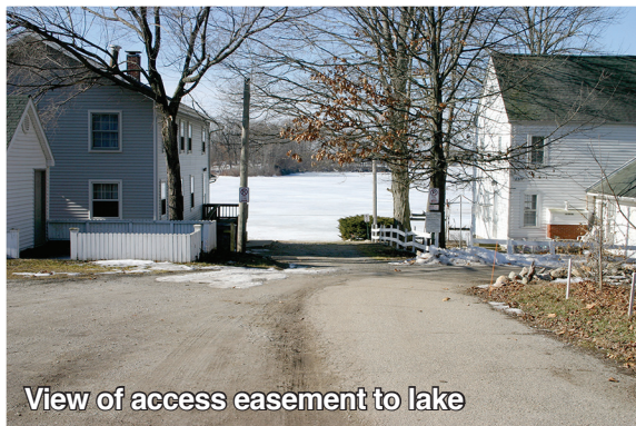
View of access easement to lake