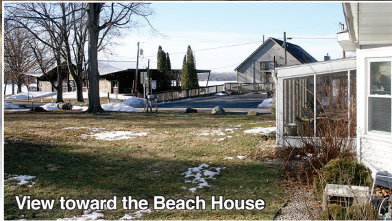
View toward the Beach House