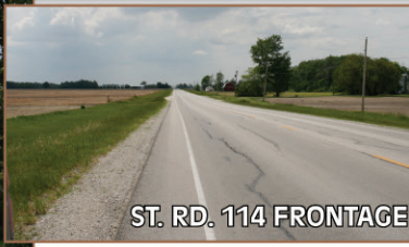
ST. RD. 114 FRONTAGE