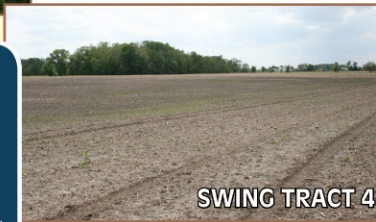
SWING TRACT 4