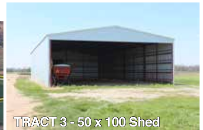
TRACT 3 - 50 x 100 Shed