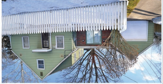
1.5 Story, 3 Bedroom Home on Corner Lot with Basement, Garage, Gas Forced Air/Central Air