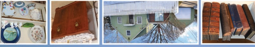
1801 Purdue Drive, Fort Wayne, IN (Auction held on site)

Personal Property: 9:00am • Real Estate: 12:30pm