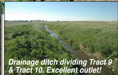
Drainage ditch dividing Tract 9 & Tract 10. Excellent outlet!

TRACT 9: 90± acres of productive farm land with frontage on Co Rd 700 S. This tract also has easy access from Co Rd 700 S and excellent outlet for drainage with an open ditch on the west boundary line. Approximately 83.7 acres of tillable farm land with 4.1 acres in waterways.